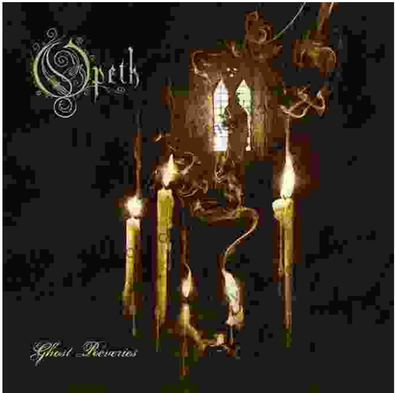
Ghost Reveries (2005)

widespread critical acclaim, solidifying Opeth's position at the forefront of progressive metal.