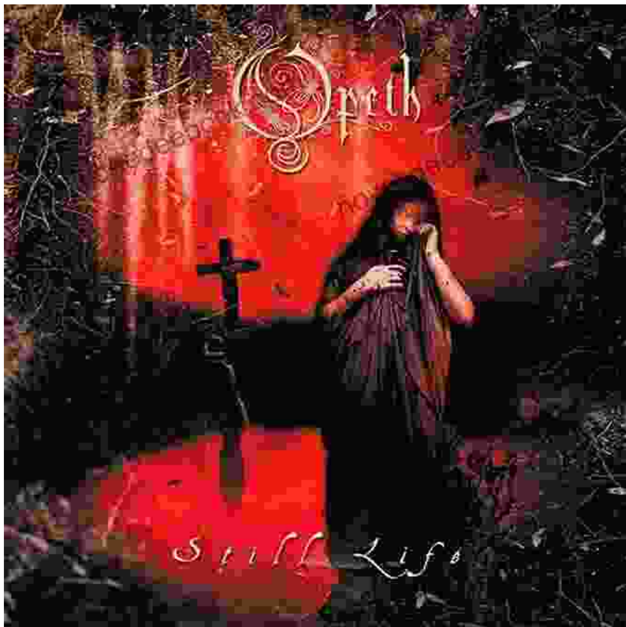
Still Life (1999)

bands. The album features some of their most iconic songs, including the sprawling 11-minute opus "Face of Melinda."