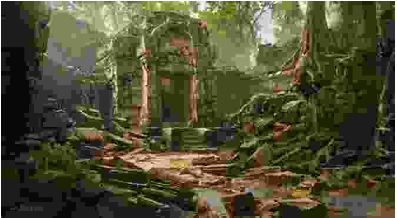
An ancient ruin in the jungle, possibly a remnant of Zykland Hara