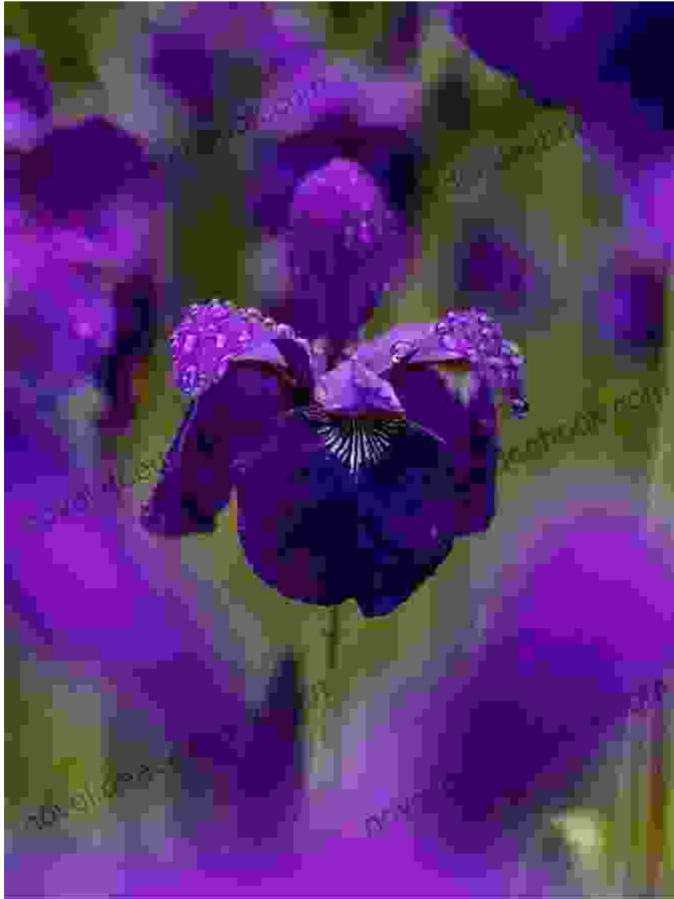
Purple Iris: A Flower of Royal Grace and Serenity