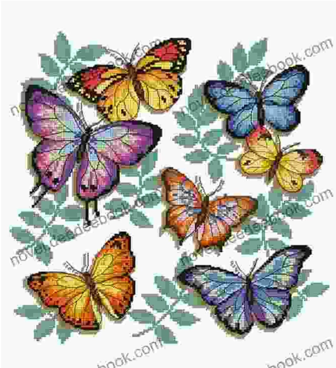
A Stunning Wall Display

Once you have completed your butterfly cross stitch masterpiece, it is time to display it with pride. Mother Bee Designs offers a range of framing options to complement your artwork, from simple wooden frames to elegant ornate frames.