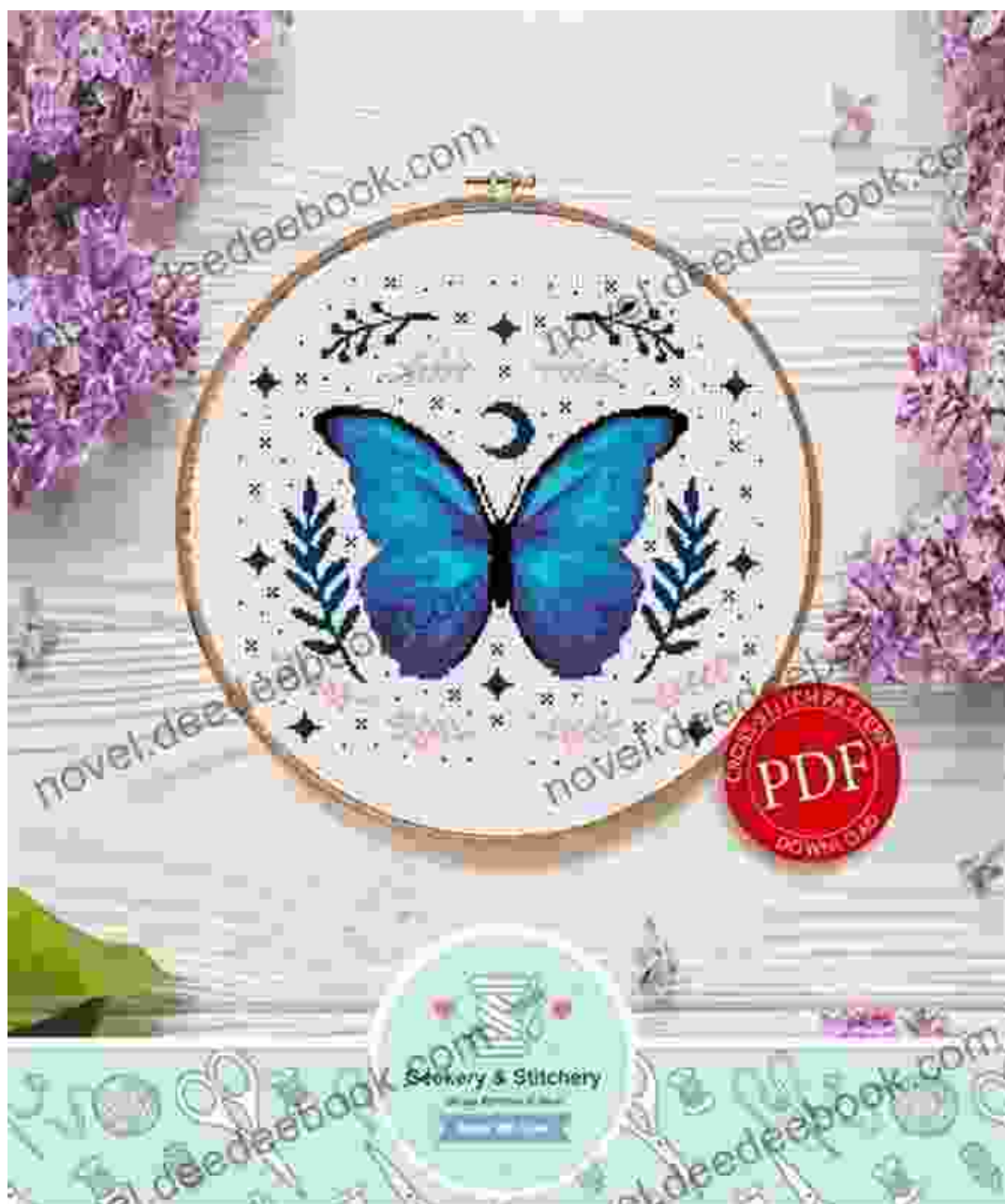
An Iridescent Masterpiece

Mother Bee Designs takes immense pride in the quality of its cross stitch patterns. Each design is meticulously created, with careful attention paid to every detail. The designers use high-quality materials, including Zweigart linen or Aida fabric, to ensure that the finished product is both durable and aesthetically pleasing.