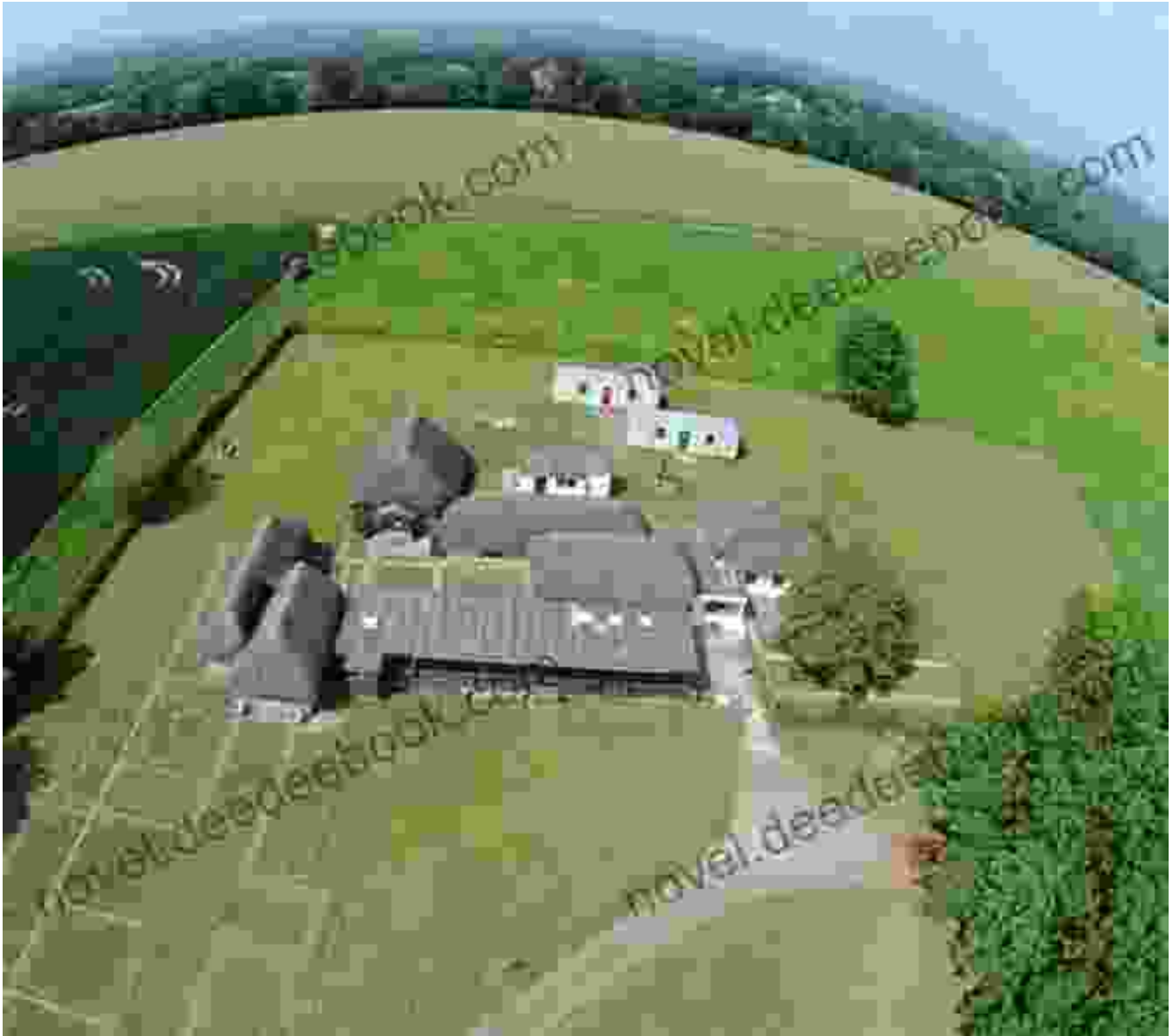
Bignor Roman Villa Folly

Unveiling a glimpse of Roman history, Bignor Roman Villa Folly stands amidst the ruins of a 4th-century Roman villa. Constructed in the early 19th century, this folly features a reconstructed Roman bathhouse, complete with mosaic floors and hypocaust heating system. Visitors can immerse themselves in the opulent lifestyle of ancient Romans while exploring this unique architectural remnant.