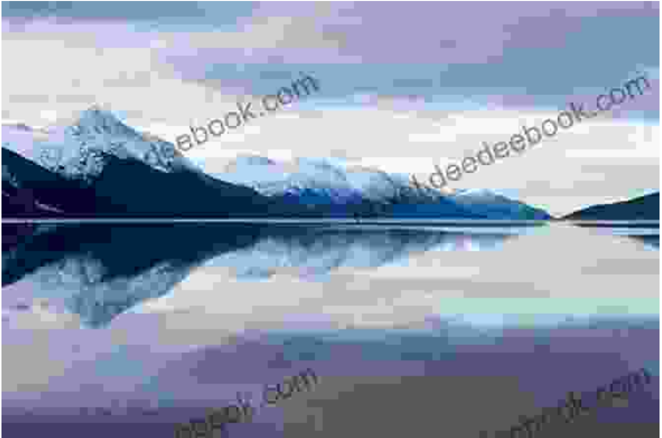
Tranquil Lake Lucerne

Switzerland's natural wonders extend beyond mountains and lakes. The Rhine Falls, Europe's largest waterfall, is a breathtaking spectacle where the mighty Rhine River plunges into a deep gorge. The Jungfrau-Aletsch Glacier, the longest glacier in the Alps, invites visitors to explore its icy realms and marvel at its awe-inspiring beauty.