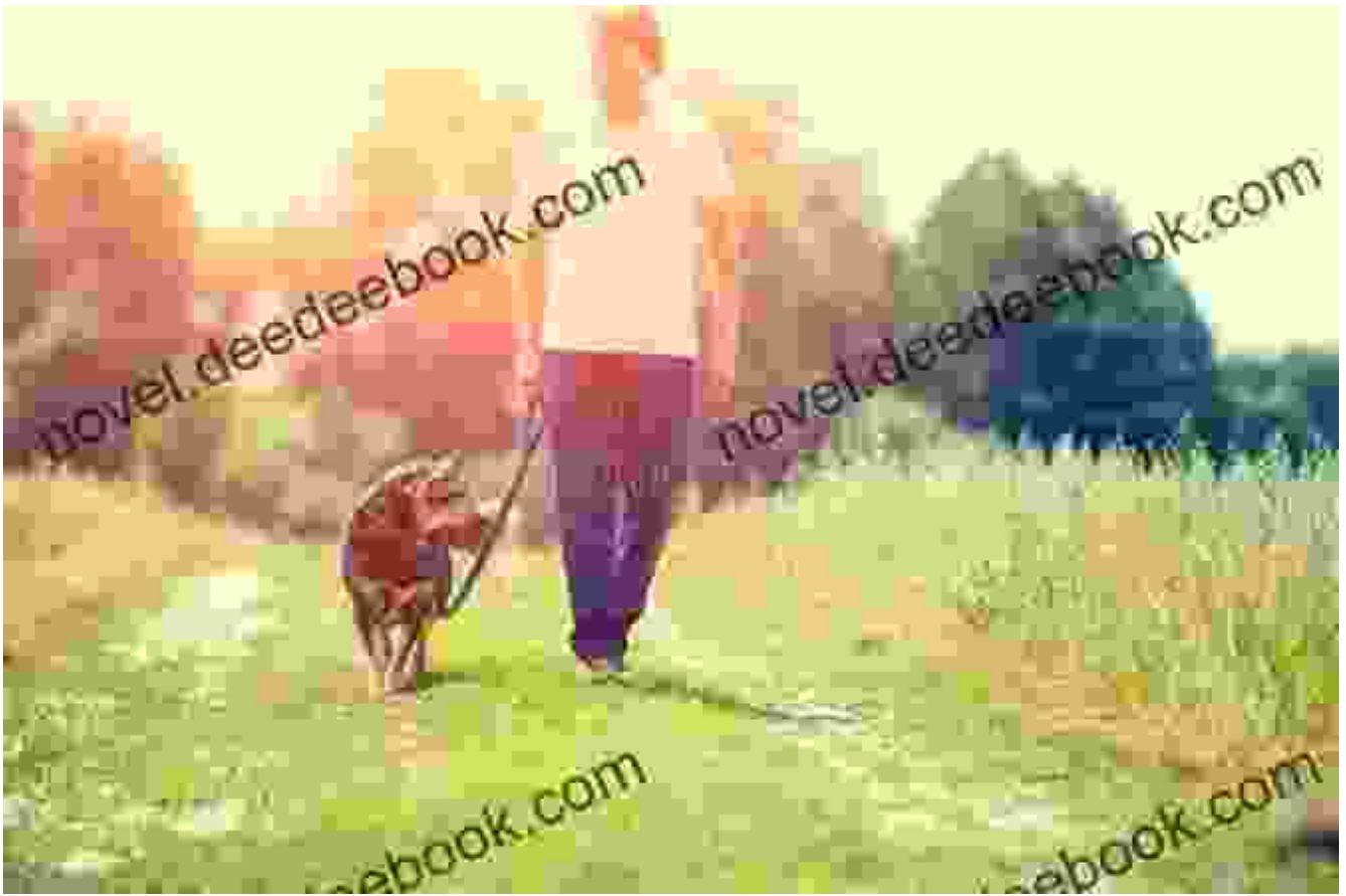
A man with six legs and his dog walking along a dirt road.