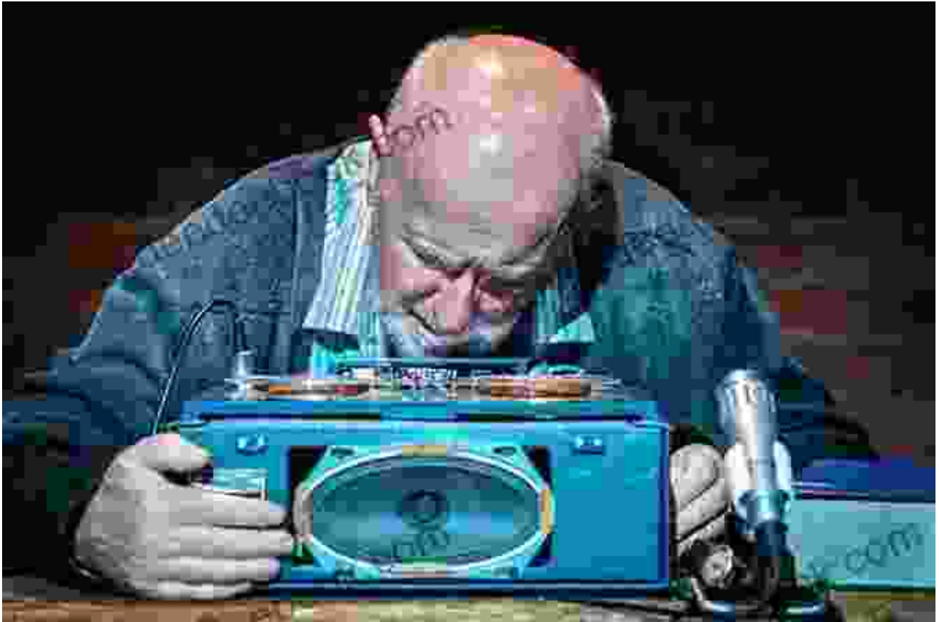
Denis O'Hare as Krapp in Krapp's Last Tape, 2007