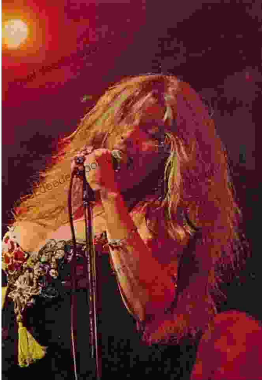
Janis Joplin performing on stage