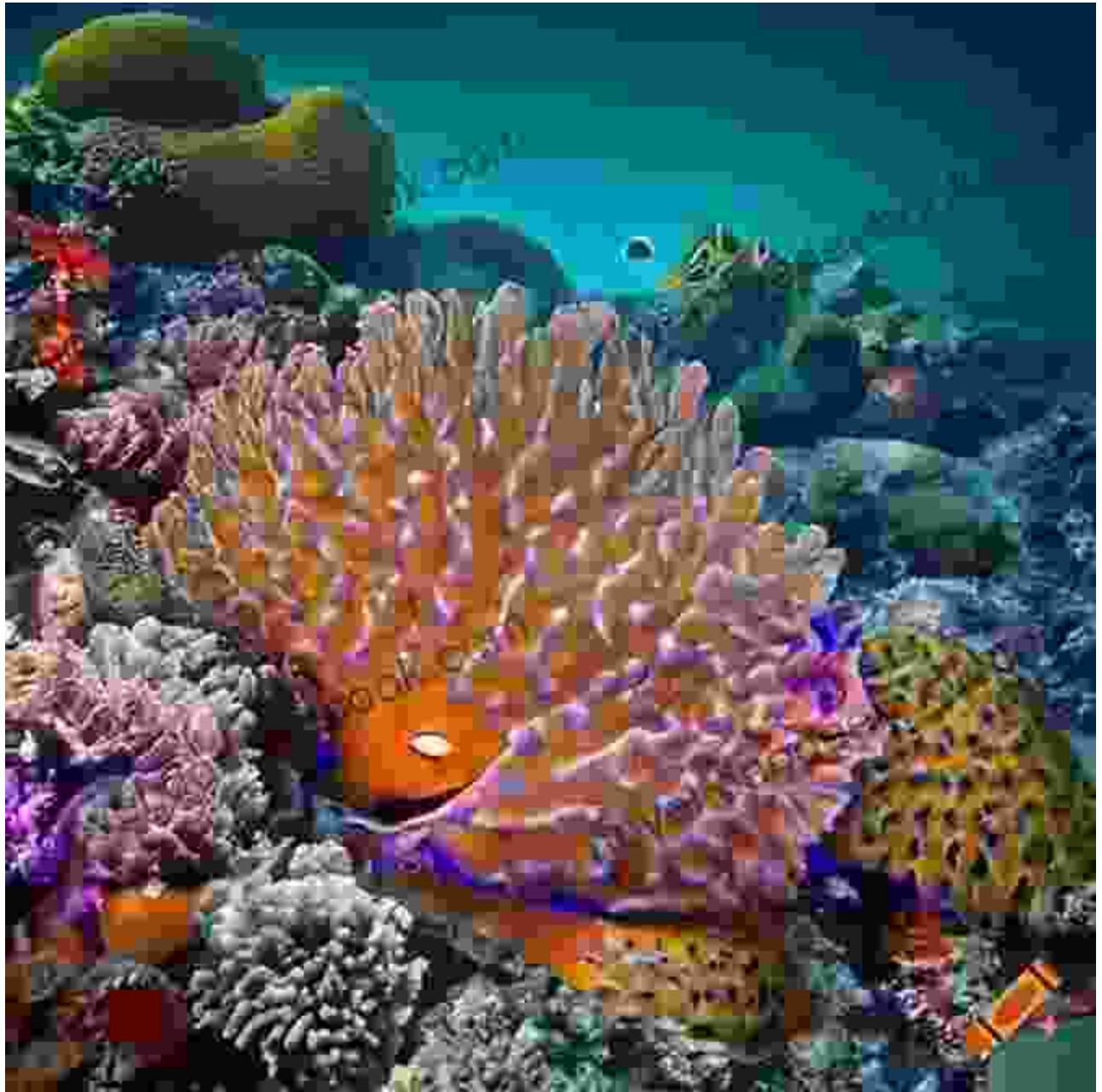
Suzanne Lafleur: A Visionary Underwater Photographer