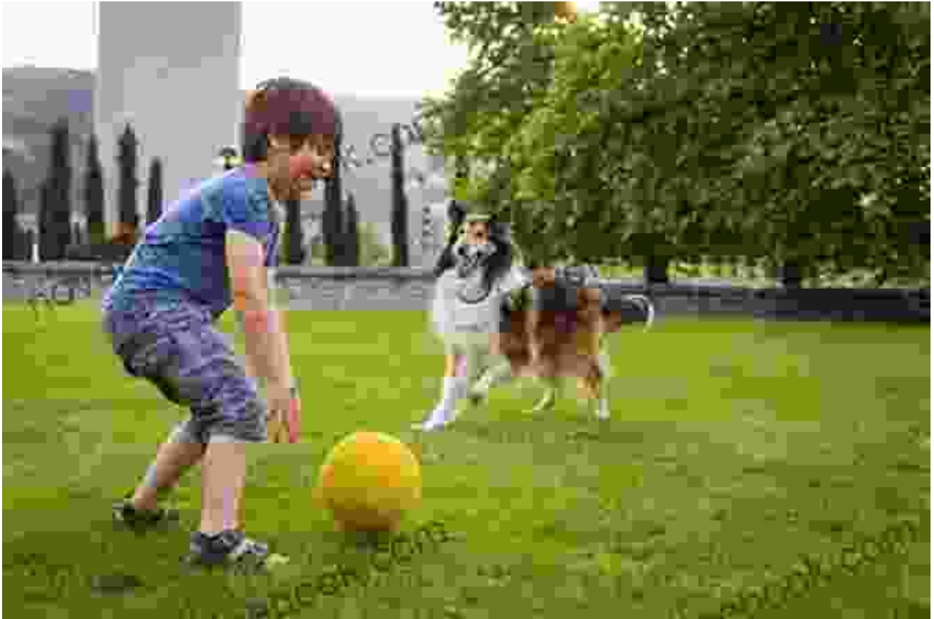
James Herriot and his dog, Tricki